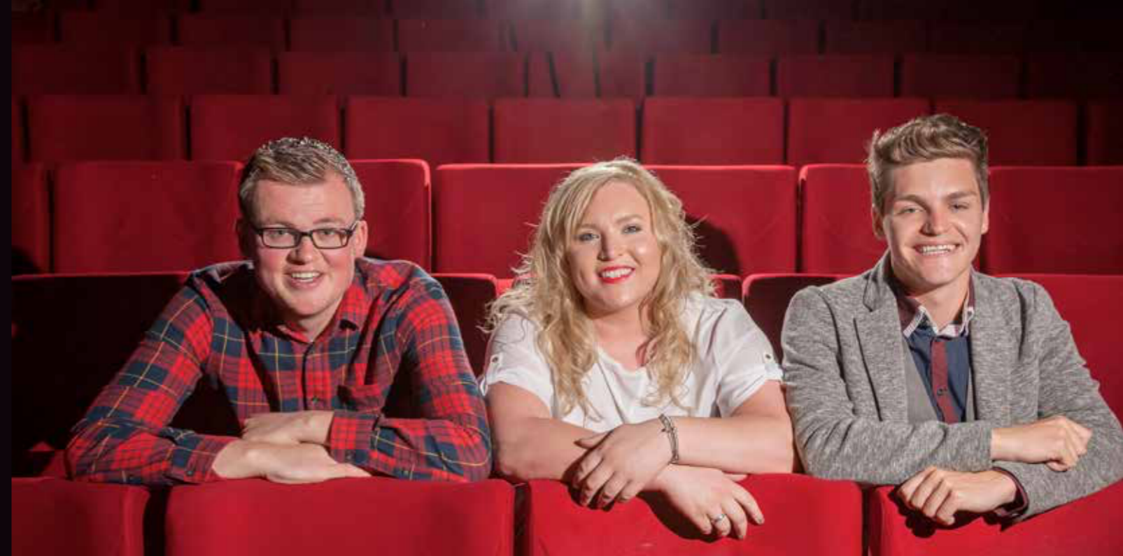
Bumper year for QMU's Film & Media Degree Show

A RECORD NUMBER OF film buffs packed Edinburgh's Filmhouse the night before graduation to see QMU's annual Film and Media Degree Show.