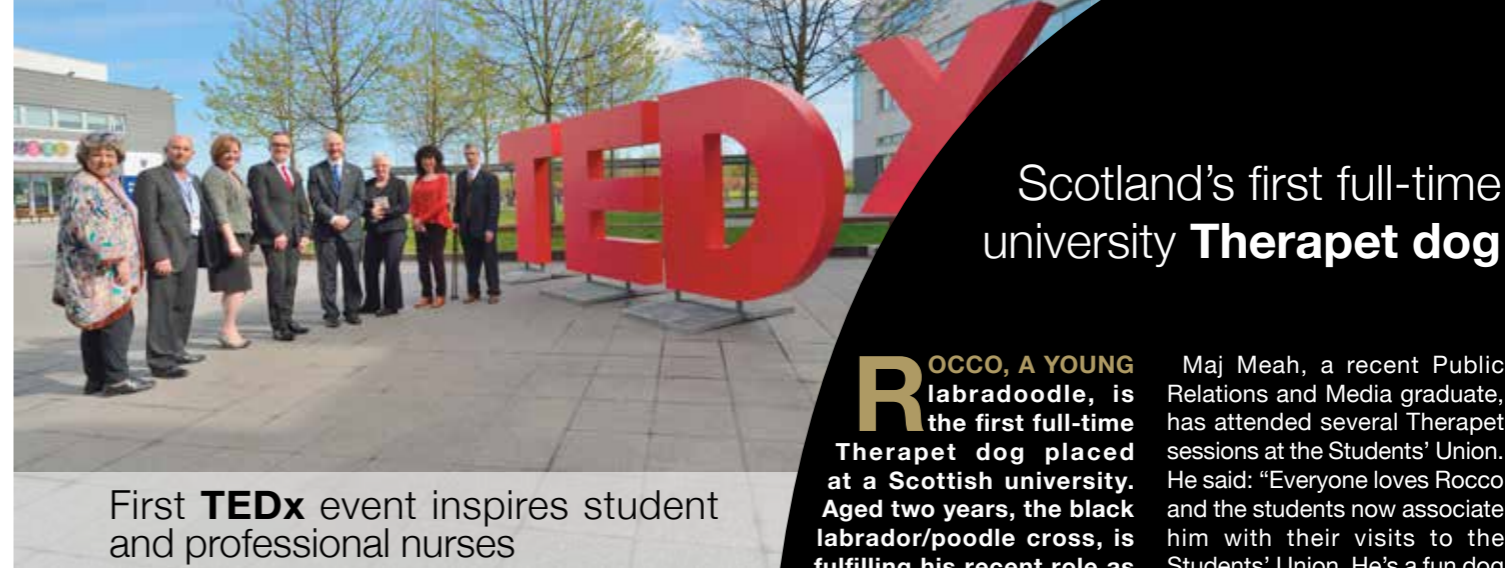
First TEDx event inspires student and professional nurses