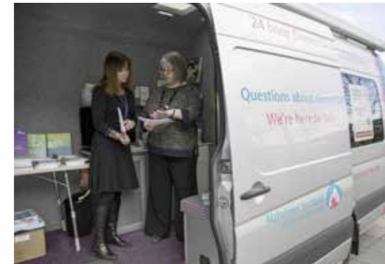
Dementia bus at University Square during student awareness event.

"QMU should be commended for taking this bold step to embed dementia education into its teaching practice. This strategic alliance offers an innovative way of educating future health professionals about dementia. By working together, with QMU students, we can make a truly meaningful contribution to patient care both in the NHS and the independent healthcare sector." □